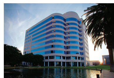
TAVA EMC Campus - Irvine

Our inaugural EMC will take place at our campus facilities in Orange County, California. This two-week, boot camp-style program for C-Levels begins on Sunday, January 11, 2026 . The program is deeply integrated into Southern California's ecosystems, offering unparalleled access to resources in strategy execution, operational excellence, cultural adaptation, funding, and expert networks—all essential for successfully launching your U.S. venture.